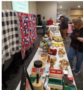
Silent Auction Table